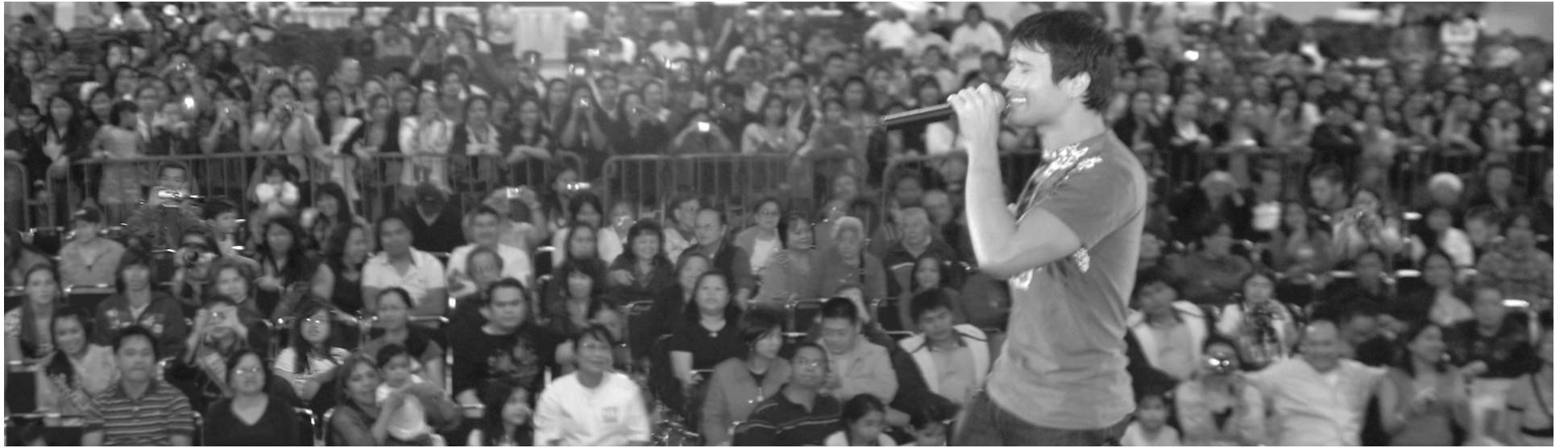
Sam Milby performing in front of a large audience at the recent Pinoy Musik Festival last May 17 & 18 at the Meadowlands Expo Center • Secaucus, New Jersey

Pinoy Musik Festival is another additional feather to the Special Edition Press, Inc.'s cap, with the 2nd Annual Pinoy Musik Festival & Expo de Mayo event held last May 17-18 . The well planned, aesthetically conceived and equally coordinated music event gave the Filipino-American community a most-deserved mid-spring breather and entertainment by way of a huge musical production from a roster of talented and