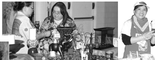
Busy Sponsors & Exhibitors at the Trade Pavilion